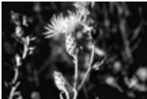
Oregon Dept. of Agriculture

Plants produce poisons so animals will avoid eating them. Most poisonous plants are unpalatable or few in number. For details on the habitat and toxic dose of poisonous plants, see: Impacts of Common Toxic Weeds on Foraging Livestock or Western Washington Poisonous Plants (for horses) .