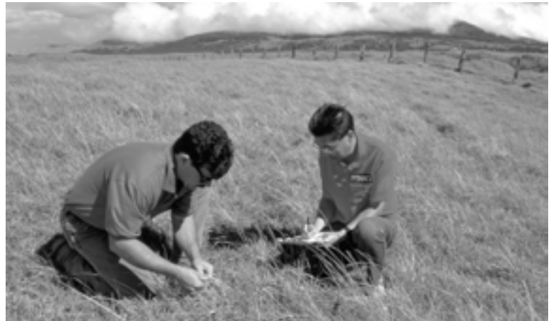
USDA Natural Resources Conservation Service