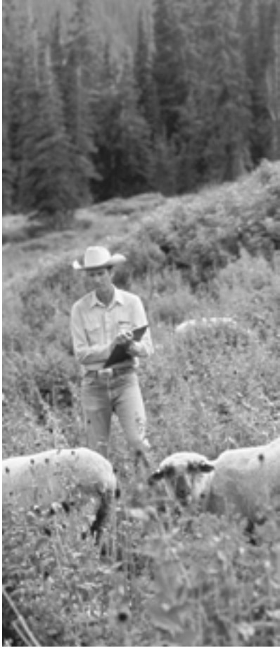
USDA Agricultural Research Service

Stop weeds from getting a foothold with the following practices: