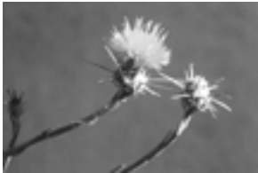
Oregon Dept. of Agriculture