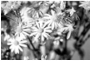
Oregon Dept. of Agriculture