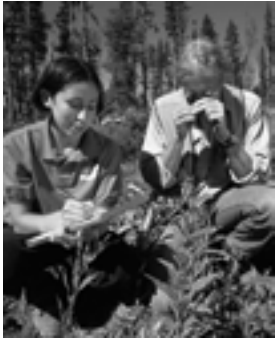
USDA Natural Resources Conservation Service

Whether planting a pasture, old field, or clearcut, you need to consider the site, soils, and existing vegetation before you plant trees. Douglas-fir and most other coniferous species are often planted on a 10' by 10' spacing. This is just over 400 trees per acre and is more than twice the number of trees required for special property tax assessment. This higher density helps in the establishment of the trees, and provides for potential income opportunities.