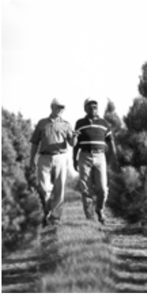
USDA Natural Resources Conservation Service