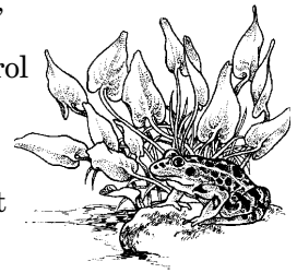
UW- Extension Service

Immediately after construction, seed the dam and pond slopes with grass. Avoid planting legumes, such as clovers and crownvetch, which attract moles, mice, and other burrowing animals. Control muskrats and nutria that may tunnel in the dam. Repair gullies, reseed bare spots, and remove any shrubs or trees that could reduce dam integrity.